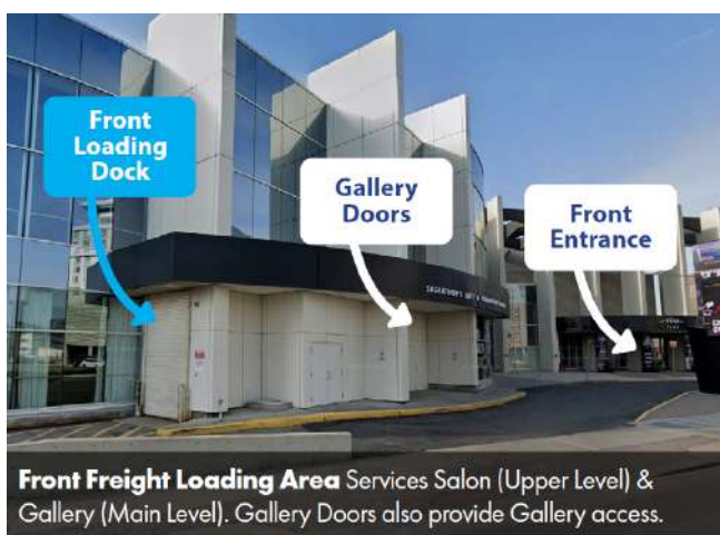
Front Freight Loading Area Services Salon (Upper Level) & Gallery (Main Level). Gallery Doors also provide Gallery access.

Front Freight Elevator 8' wide, 19' long, 8' high Load capacity 10,000 lbs.