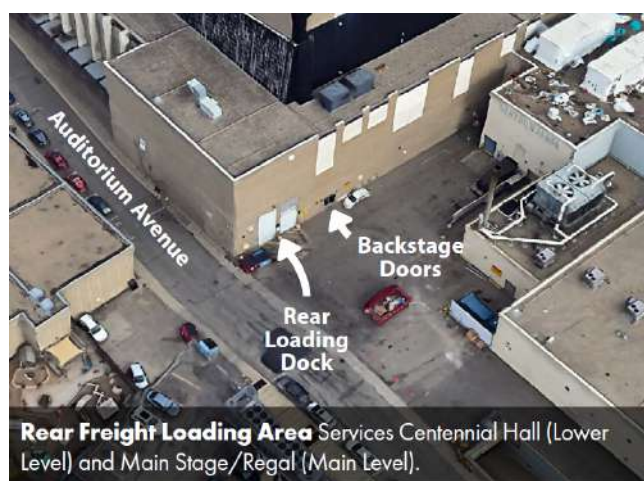
Rear Freight Loading Area Services Centennial Hall (Lower Level) and Main Stage/Regal (Main Level).

Front Freight Elevator 8' wide, 19' long, 8' high Load capacity 10,000 lbs.